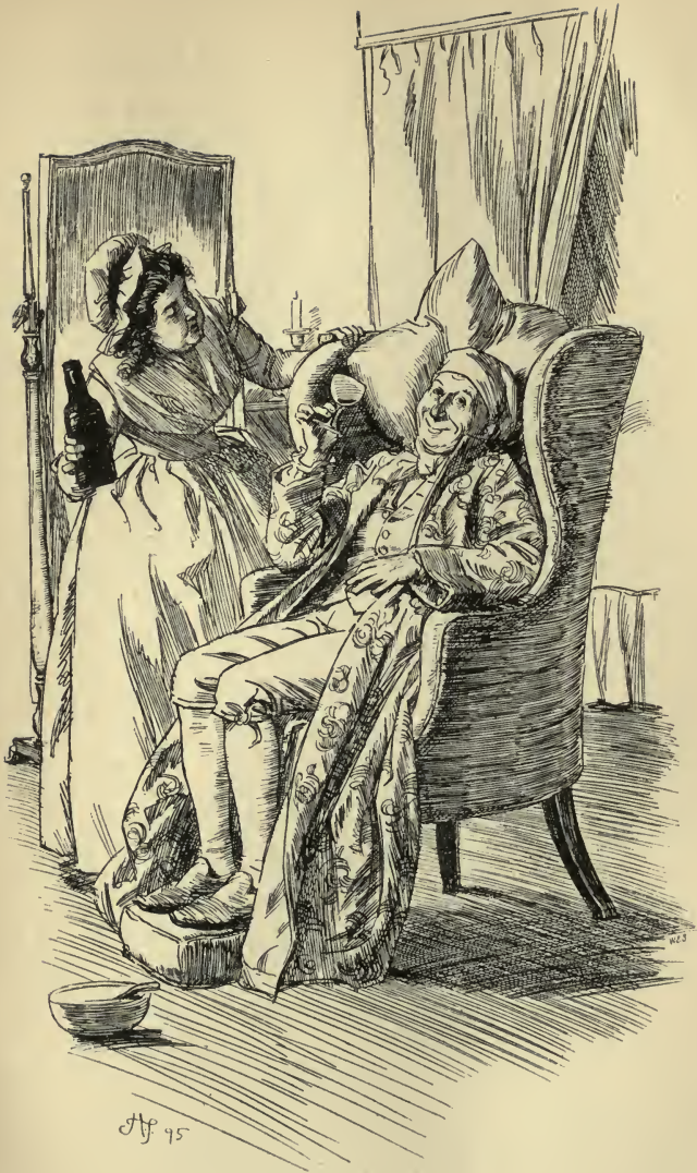
'How fond he was of it!'